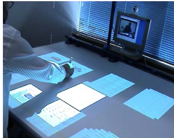
Figure 3. Augmenting a videoconference with a desk surface that is shared between collaborators.

We have conducted tests in which pairs of participants converse over a standard videoconference while using Escritoire desks whose contents are shared in a What You See Is What I See fashion (Figure 3). As they talk they can work together to read and annotate documents, gesturing in the shared graphical space as they do so. Systems for remote collaboration often concentrate on optimizing the talking heads model of a standard videoconference but we believe that a shared task space will often be more useful. The shared space provided by the Escritoire is much larger than a monitor screen and supports fast and natural interaction over the whole area, so users share a large visual context while being able to easily refer to and collaborate on specific items.